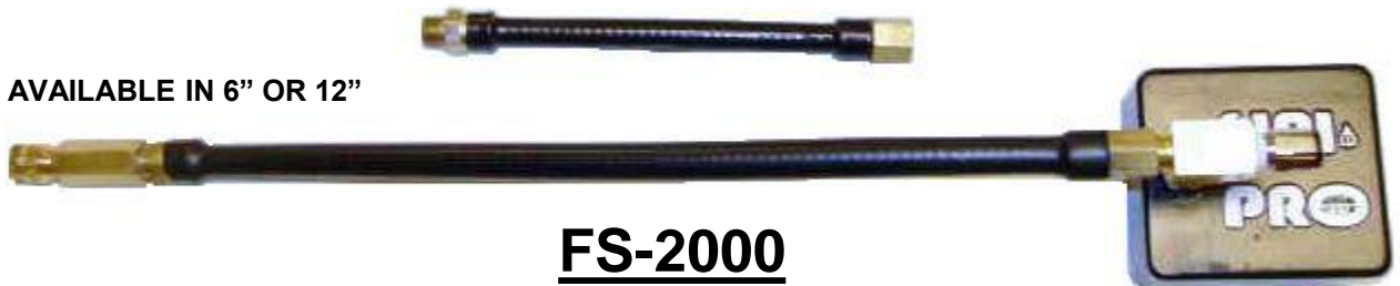
FS-2000 FLEXIBLE SPRAYER