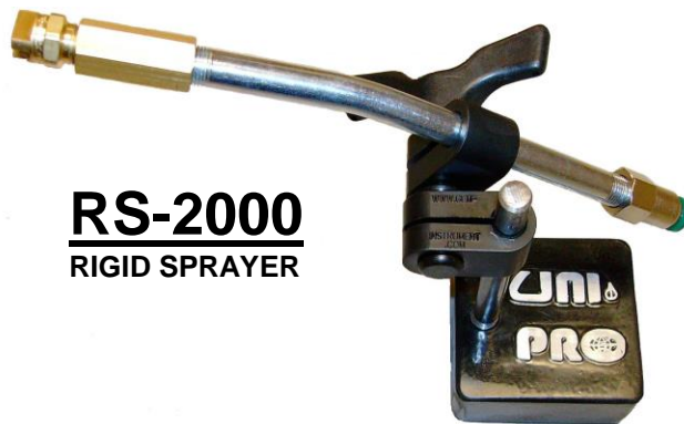
RS-2000 RIGID SPRAYER